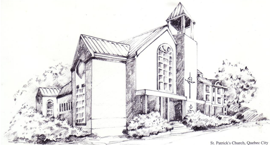
St. Patrick's Church, Quebec City