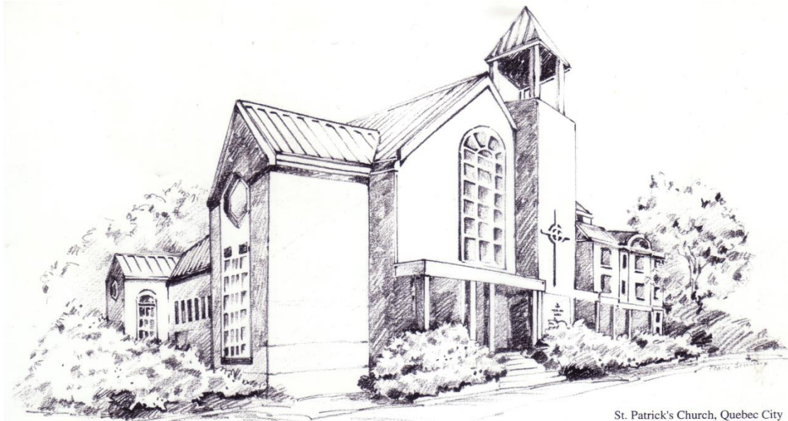
St. Patrick's Church, Quebec City