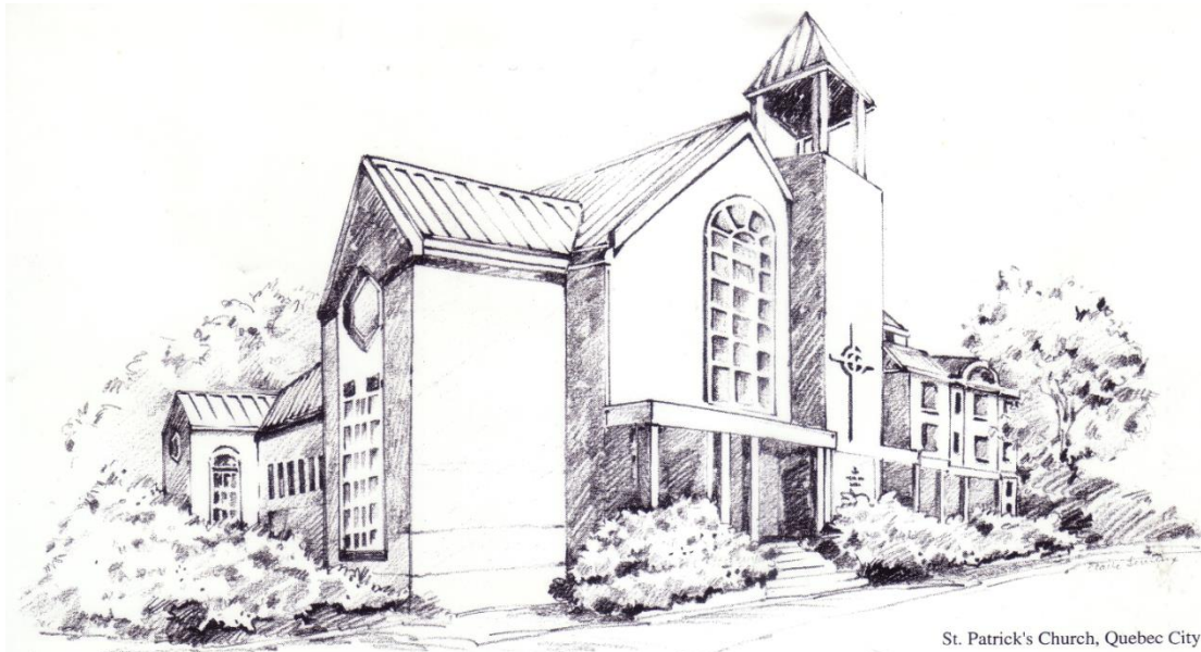
St. Patrick's Church, Quebec City