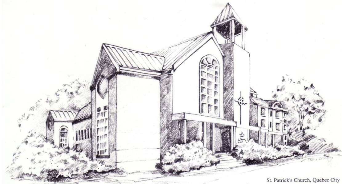
St. Patrick's Church, Quebec City