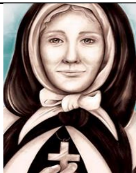
St. Marguerite Bourgeoys

The more I follow Him without fear, the more He will protect me