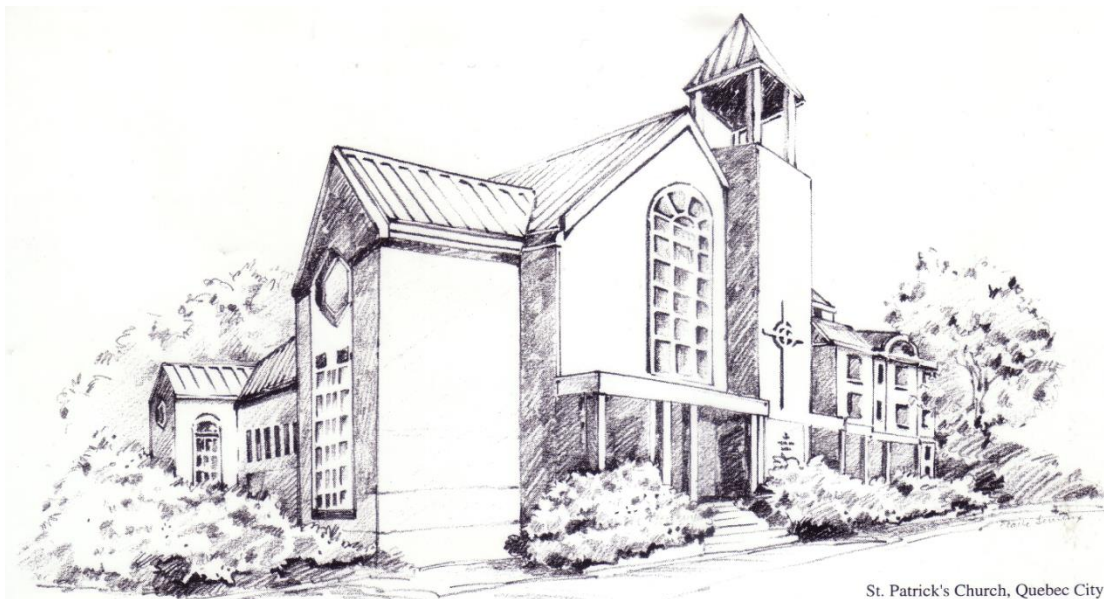
St. Patrick's Church, Quebec City