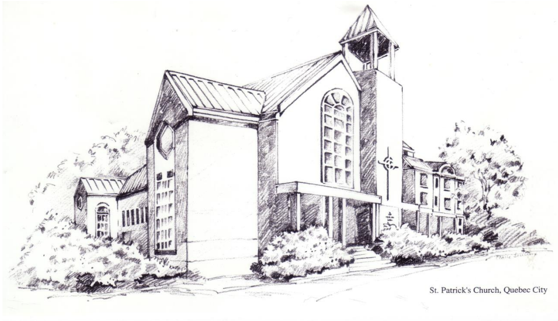
St. Patrick's Church, Quebec City

1145 De Salaberry Quebec City QC G1R 2V7 418-524-3544 tel. 418-524-3541 fax